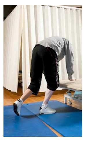
Method 2 Continued

5. Place your hands on chair/bed/sofa (stable surface) and push yourself into kneeling with your good leg.